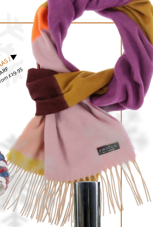
▲ FRAAS / SCARF from £29.95