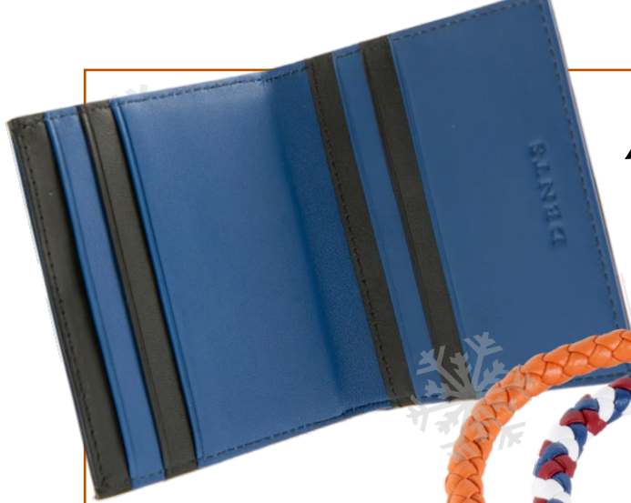
▲ DENTS / LEATHER WALLET WITH BLUE INTERIOR £39.95