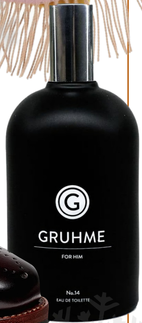
▲ GRUHME / ZESTY No.14 EDT £55