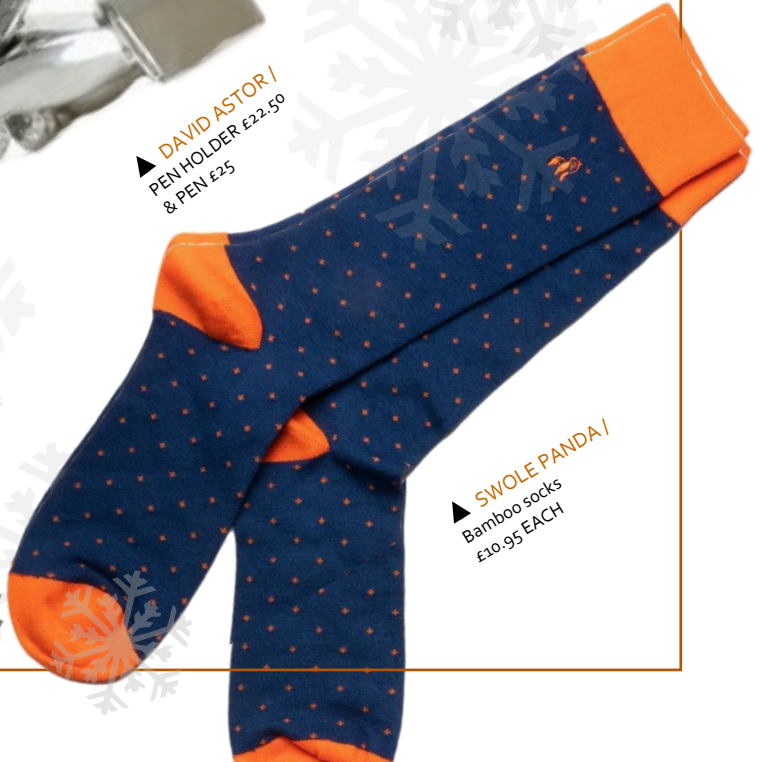
▲ SWOLE PANDA / Bamboo socks £10.95 EACH