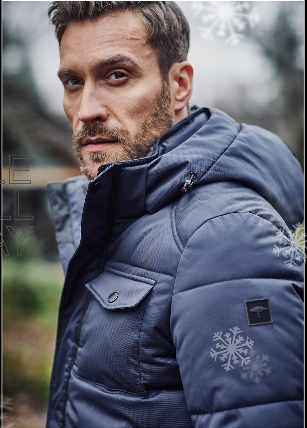
Padded coat from Fynch Hatton £250