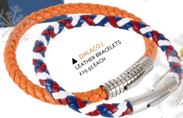
▲ DALACO / LEATHER BRACELETS £29.95 EACH