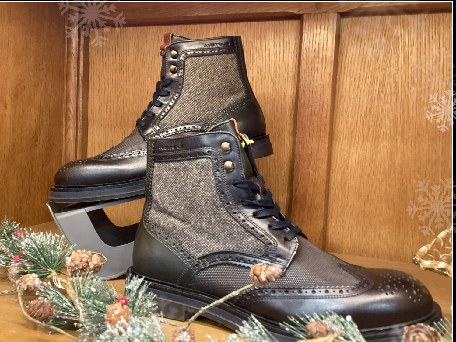
Leather & Tweed boots from Ambitious £180