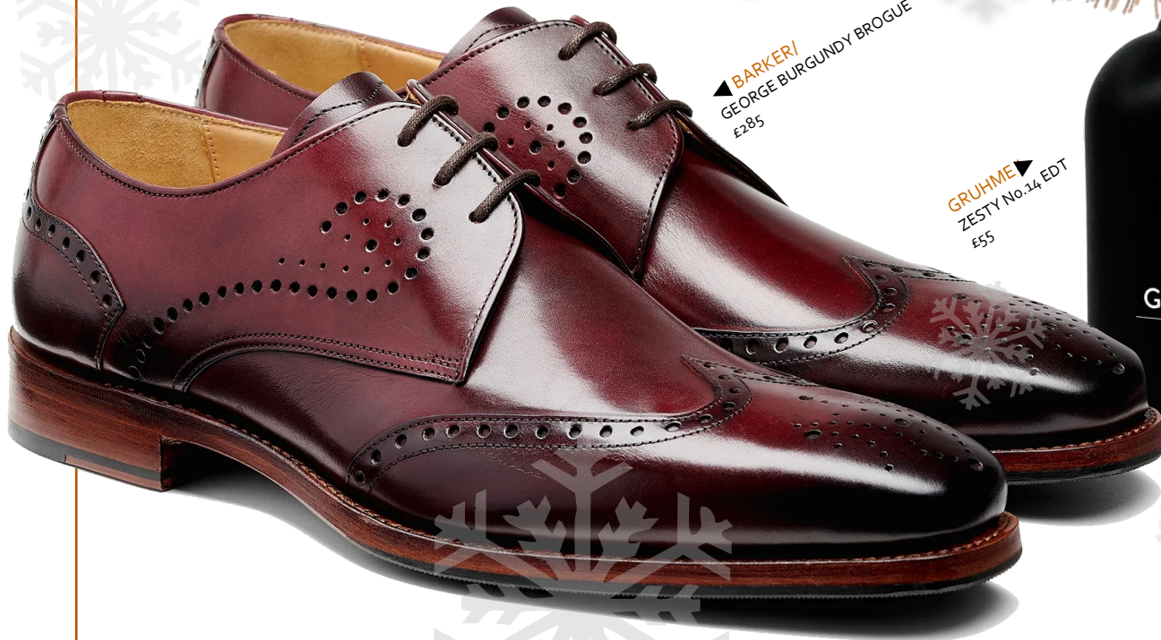
▲ BARKER / GEORGE BURGUNDY BROGUE £285