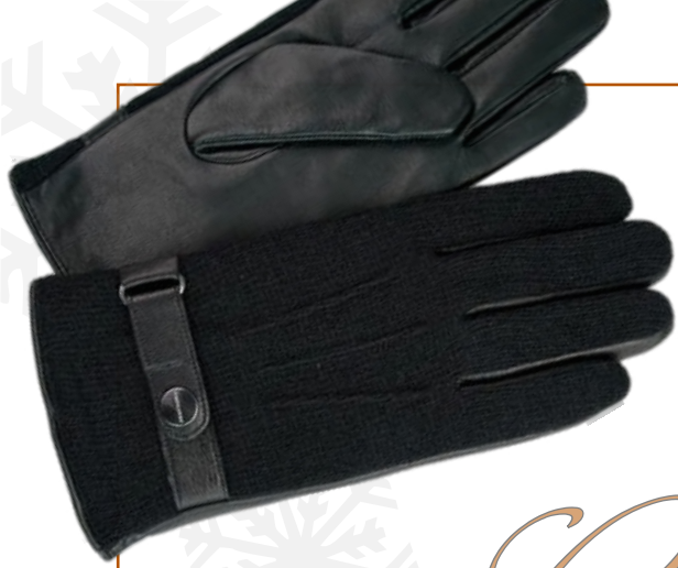
▲ DENTS / WOOL-BACKED LEATHER GLOVES £55