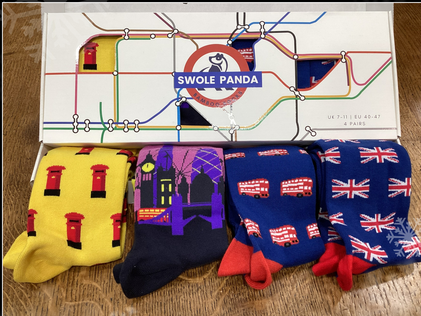
Four-sock box by Swole Panda £39.95