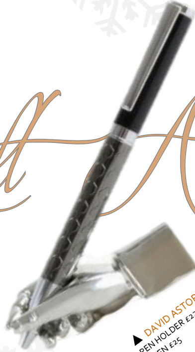
▲ DAVID ASTOR / PEN HOLDER £22.50 & PEN £25