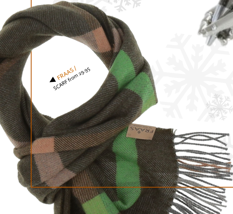
▲ FRAAS / SCARF from 29.95